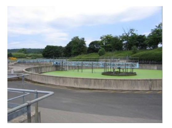
Figure 1: A typical humus tank

There are a large number of legacy biological filtration plants in the UK, dating back to the 1920's and 1930's. In such plants, the influent waste water is screened and settled in primary tanks prior to filtration in biological filter beds. Effluent from these beds passes to humus tanks, where residual solids are allowed to settle out. Final effluent may then be polished through sand filters prior to discharge. Humus tanks are similar in design to other types of primary and secondary settlement tanks. They can be of a radial flow, upward flow, or horizontal flow type. The sludge must be removed from the tanks regularly and in a large works continuously.