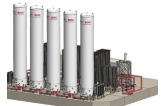
Figure 1: Nitrogen Deluge System

MMI considered all operational loading conditions, including wind, thermal, and seismic assessments of critical components. Results from these analyses were used to fully qualify the nitrogen deluge system prior to installation and operation