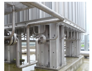
Figure 3: Pipework detail into base of liquid nitrogen vaporisers